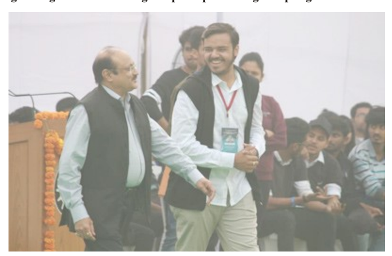
Director discussing about the 2017-18 version of Sports Events.