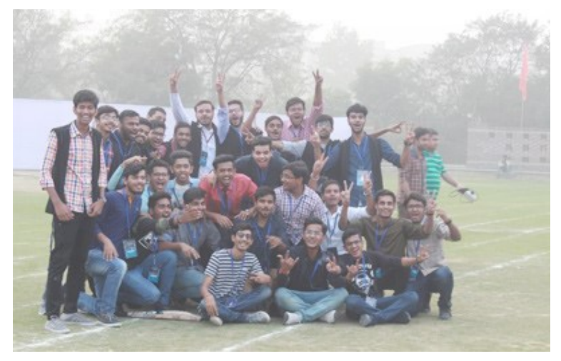
The Organising Team of the event.