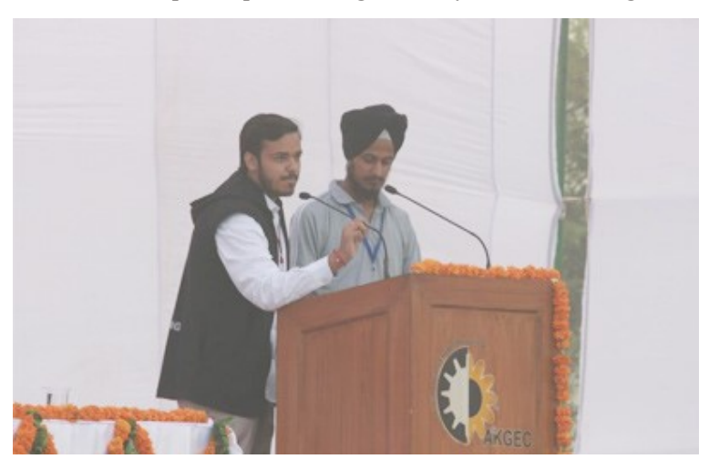
Organising Head and College Captain giving the Vote of Thanks.