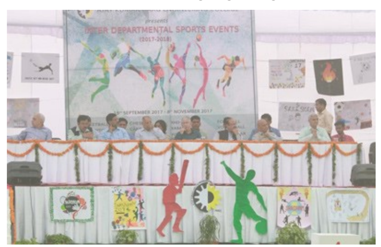
All the dignitaries witnessing the closing ceremony.