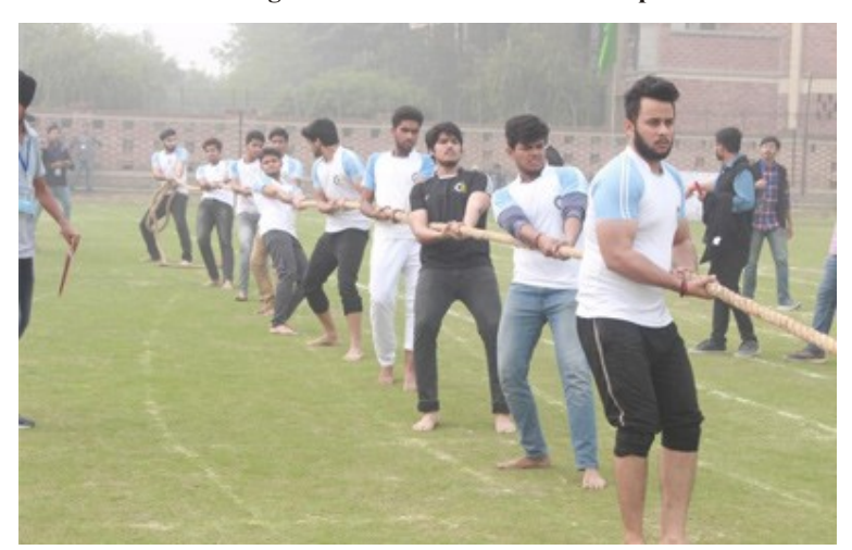
ME vs EN Tug Of War (Boys) Final match.