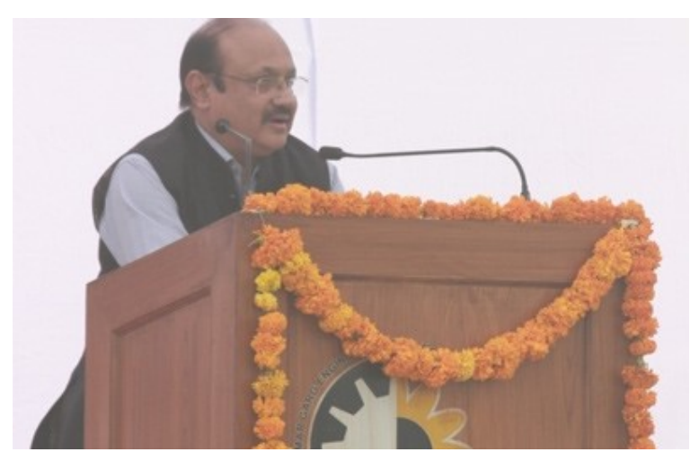
Director addressing the gathering.