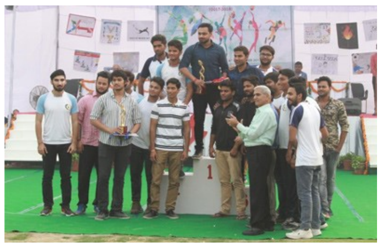
Prize distribution ceremony.