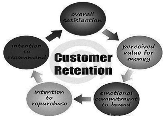
Figure 2. Customer Retention Process

M. Satish, K.J Naveen, V. Jeevananthan, (2011) identified different factors that influence the consumers to switch the different mobile service providers. Their research concluded that there is a relation between switching the service provider based on the factors like poor network coverage, frequent network issues, call rates, influence from family and friends and word of mouth communication.